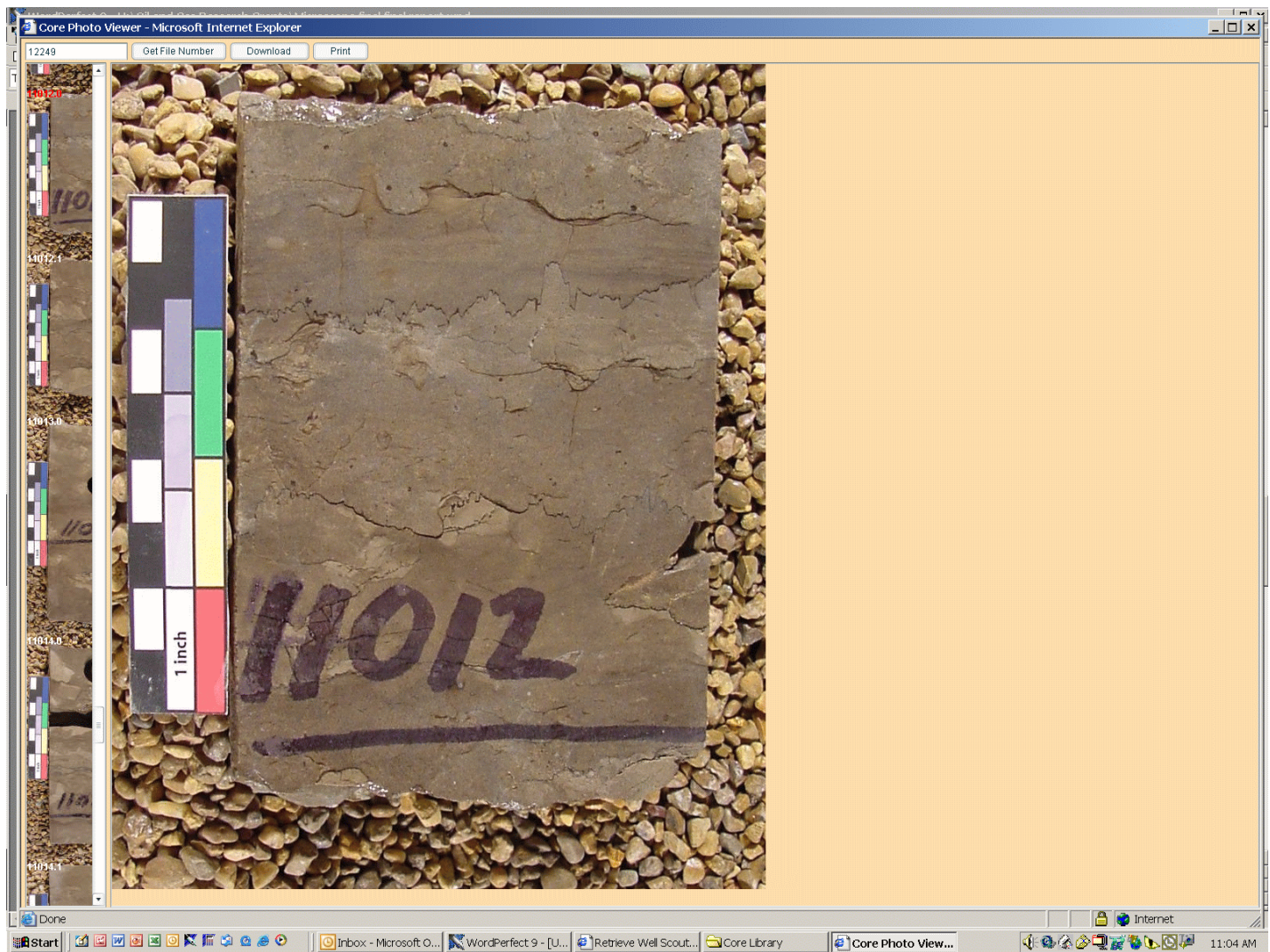
Figure 2. A photograph of a core of limestone in the Birdbear Formation (Devonian) at a depth of 11,012 feet from a well in the Pierre Creek Field, McKenzie County. This screen print was obtained from ND Oil and Gas Division's subscription site.