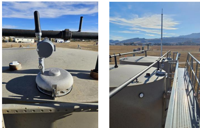
Figure 1: Typical Well Site Storage Tank with Device Installed

The following are the milestones that were not fully realized in Phase I: