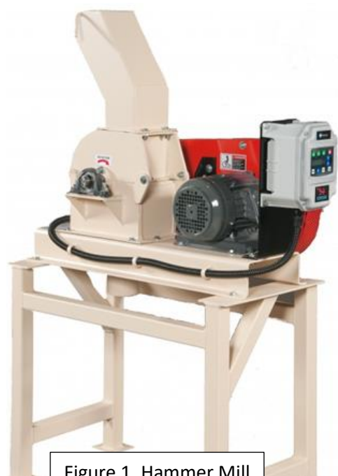
Figure 1. Hammer Mill

In this task the primary goal was to identify the impact of processing variables on the particle size and production of fines. Both wheat and soybean straw fibers were milled using a W-6-H Model Hammer Mill (Schutte Buffalo, Buffalo, NY) as shown in Figure 1. Two different screen sizes, three milling speeds and three different fiber moisture levels were considered in this experiment.