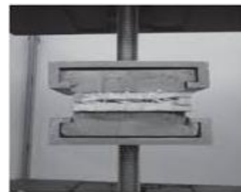
Figure 4. Test jigs a. Three point bending jig b. Bending test c. Internal bond test